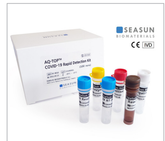
Season Biomaterials' COVID-19 RT-PCR Test Kit (Reverse Transcription - Polymerase Chain Reaction)

MicroDigital's AB96-COVID1-19 IgG is an ELISA (Enzyme-Linked Immunosorbent Assay) kit for detection of IgG antibodies to SARS-CoV-2 Nucleocapcid Protein and can be used to confirm past infections or asymptomatic infections. The test is intended for the qualitative detection of total antibodies to SARS-CoV-2 in human serum, providing a valuable aid for identifying individuals with an adaptive immune response to SARS-CoV-2 that indicates recent or prior infection.