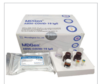
MicroDigital's AB96-COVID1-19 IgG ELISA N1 test kit