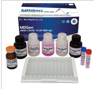
MicroDigital's AB96-COVID1-19 IgG ELISA N1 test kit